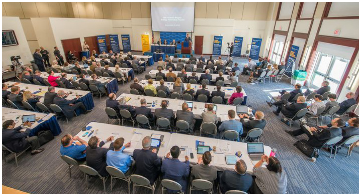
Senator Joe Manchin (WV) speaks to attendees at the Mid-Atlantic Region Energy Innovation Forum, sponsored by the West Virginia University Energy Institute on September 12, 2016, in Morgantown, West Virginia.