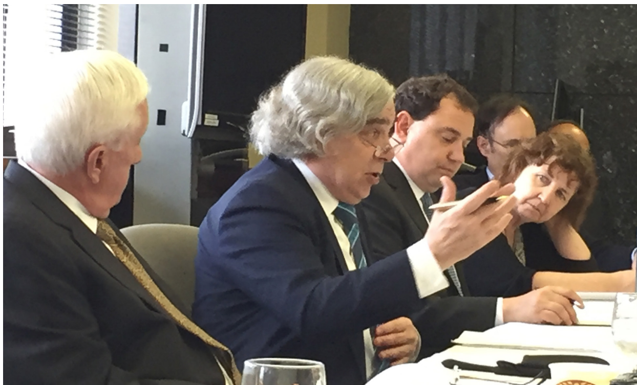
U.S. DOE Secretary of Energy Ernest J. Moniz discusses the importance of the intersection of energy and water policies as part of the Integrating People, Technology, and Natural Resources for a Clean Energy Future: Roundtable Discussion on Mission Innovation at the University of Texas at Austin on May 9, 2016.