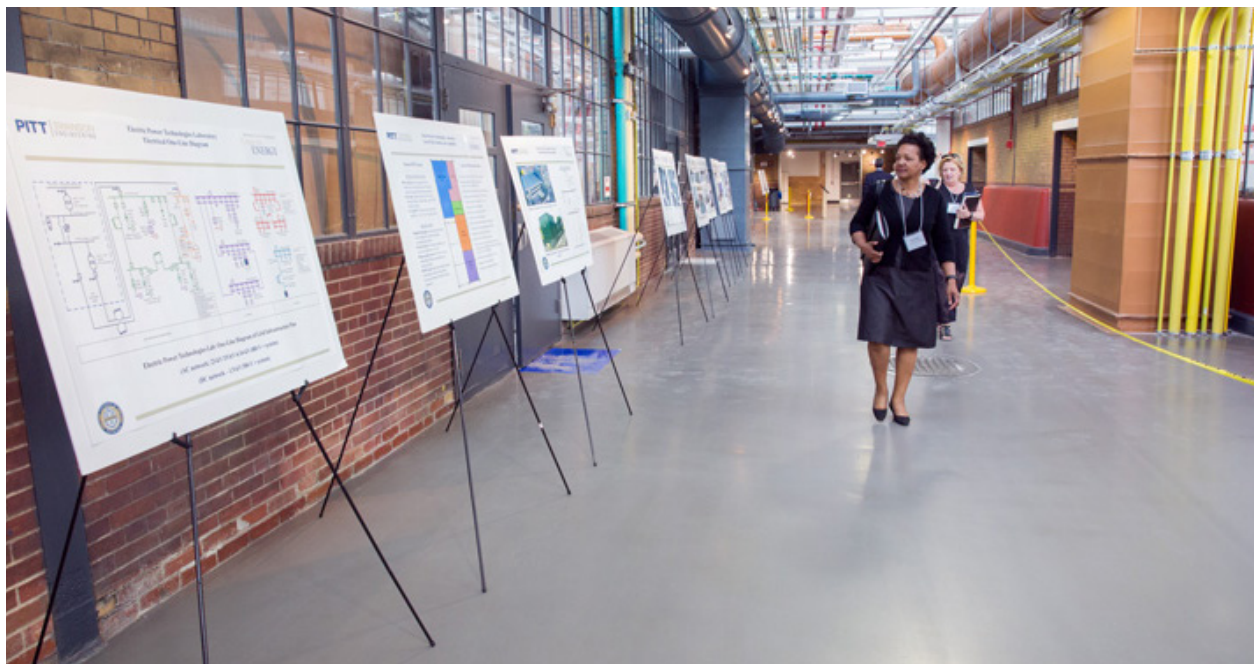
Attendees view posters on grid modernization and other clean energy topics at the Mission Innovation Workshop on Grid Modernization, held at the University of Pittsburgh's Center for Energy in Pittsburgh, Pennsylvania, on June 24, 2016.