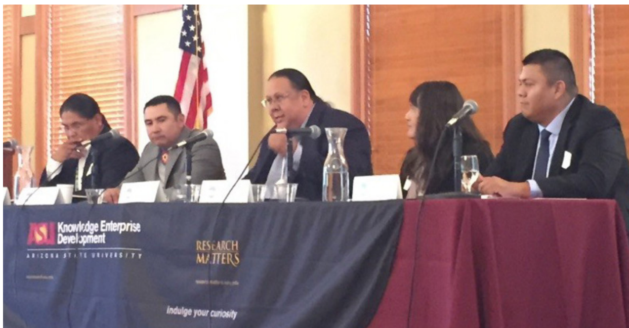
Panelists discuss the importance of American Indian tribal lands to next-generation clean energy and efficient water use as part of the “Water-Energy from the Tribal Perspective” panel at the Southwestern Regional Water-Energy Nexus Event, held at Arizona State University in Tempe, Arizona, on September 8, 2016. (Arizona State University)

Observations were made at the Arizona State University that “the most significant obstacle to maximizing renewable energy sources is storage. As it currently stands, wind farms must be shut down if we have a surplus of solar energy. Hydroelectric generators go to waste without a method of storing excess power. Power companies, cooperatives, and administrators should not have to take generators offline because there is no way to store the energy.” 119