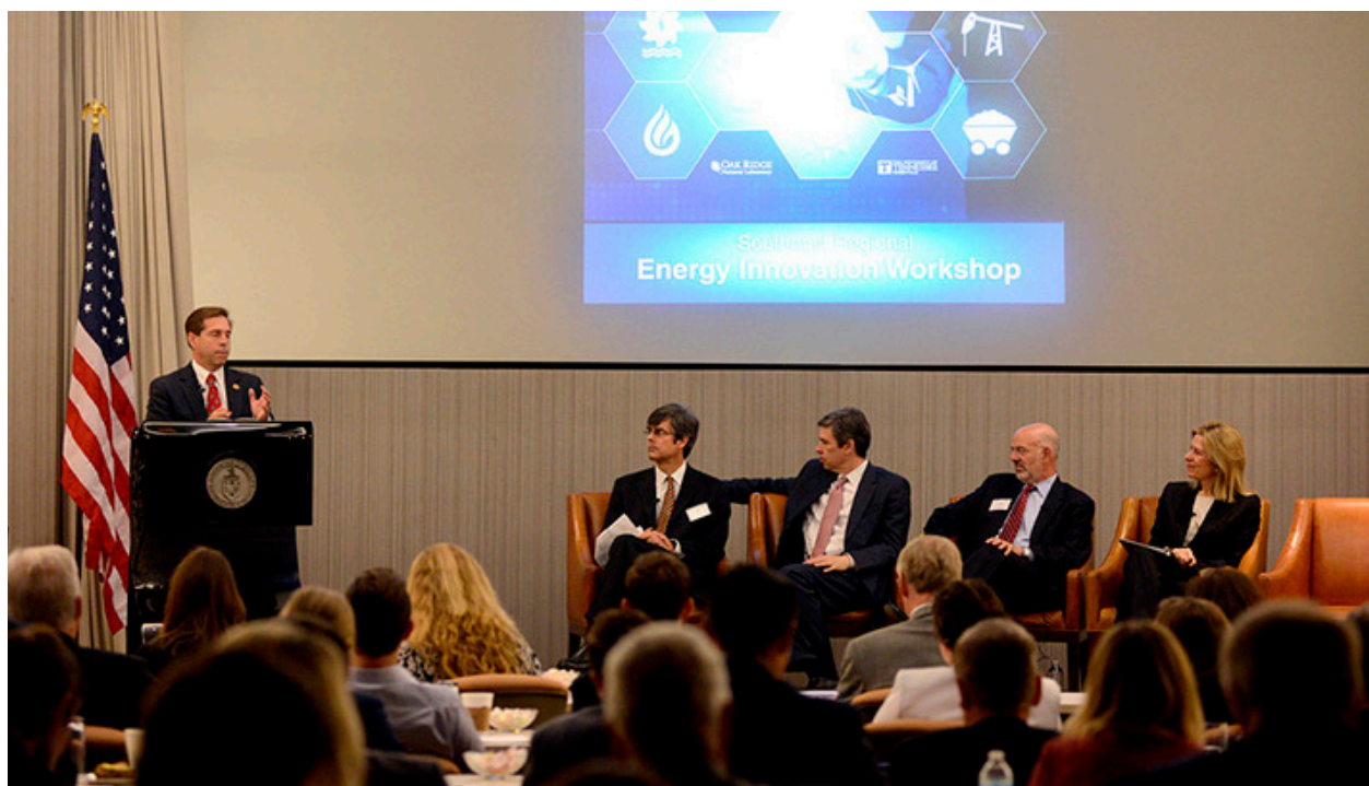
U.S. Representative Chuck Fleischmann (TN-03) speaks to participants during a welcome panel at the Southeast Regional Energy Innovation Workshop, hosted by The University of Tennessee at Chattanooga, Tennessee, on May 23, 2016.

The ability of DOE’s national labs to integrate computational and experimental capabilities to support innovation was echoed in West Virginia and Tennessee: “Our [NETL’s] advanced computational and laboratory assets can help advance technologies toward commercialization. NETL has core capabilities that allow us to look at technology in its discovery state and help colleges and industry mature technology to commercialization.” 83 “Together, [Oak Ridge National Laboratory’s] SNS [Spallation Neutron Source] and HFIR [High Flux Isotope Reactor] are leading neutron scattering facilities in the country and are used to characterize a wide variety of materials including structural and functional materials, polymers and even in structural biology. ... The Center for Nanophase Materials Science is another user facility that offers collaborative opportunities with the center’s experts in material synthesis, nano fabrication, materials characterization and theory. ... Finally, the Oak Ridge Leadership Computing Facility (OLCF) is the fourth DOE SC (Office of Science) user facility that provides world-class leadership high-performance computing to the nation’s scientific community.” 84