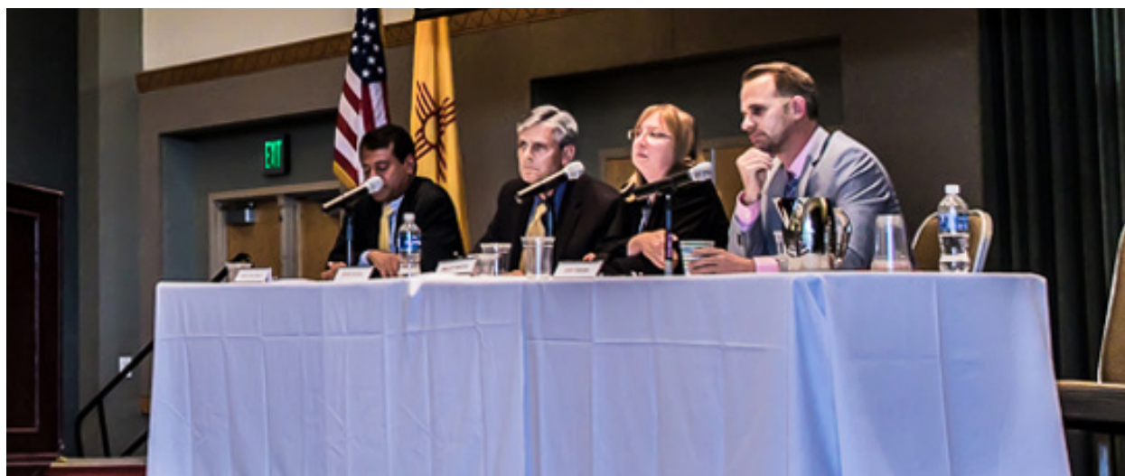
Panelists discuss materials solutions for electrical energy storage at the Southwest Regional Energy Innovation Forum: Materials Technology for Clean Energy, hosted by the University of New Mexico in Albuquerque on July 5, 2016.