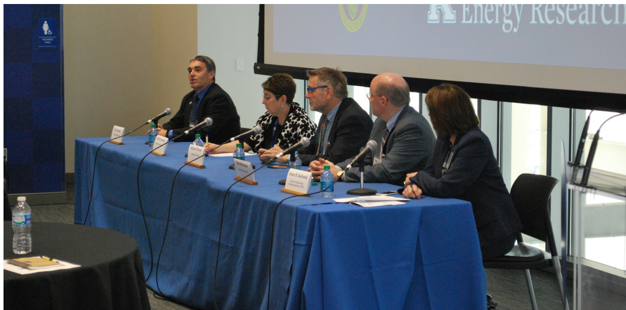
Speakers on the “Innovation, Combustion and CCS Panel” took questions from the audience at the Regional Energy Innovation Forum, hosted by the University of Kentucky in Lexington, Kentucky, on April 21, 2016.

In sum, discussions in multiple forums and workshops indicated that while current technologies can improve the efficiency of buildings, further RD&D can deliver technologies to increase the efficiency of both new and existing buildings. In particular, smart buildings (structures that record, transmit, and optimize their energy