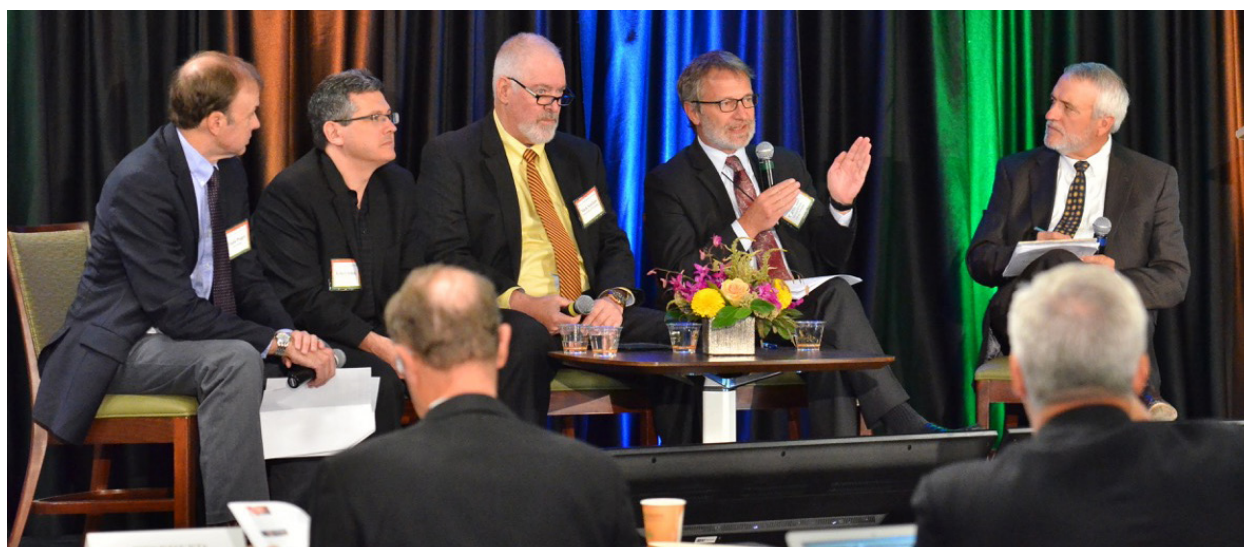
Panelists discuss regional energy needs in renewables, fossil fuels and carbon capture, water, and electric grid and transmission during the North Central/Inter-Mountain West Regional Clean Energy Innovation Summit, hosted by the Colorado Energy Research Collaboratory and held at the University of Colorado, Boulder, on September 19, 2016.