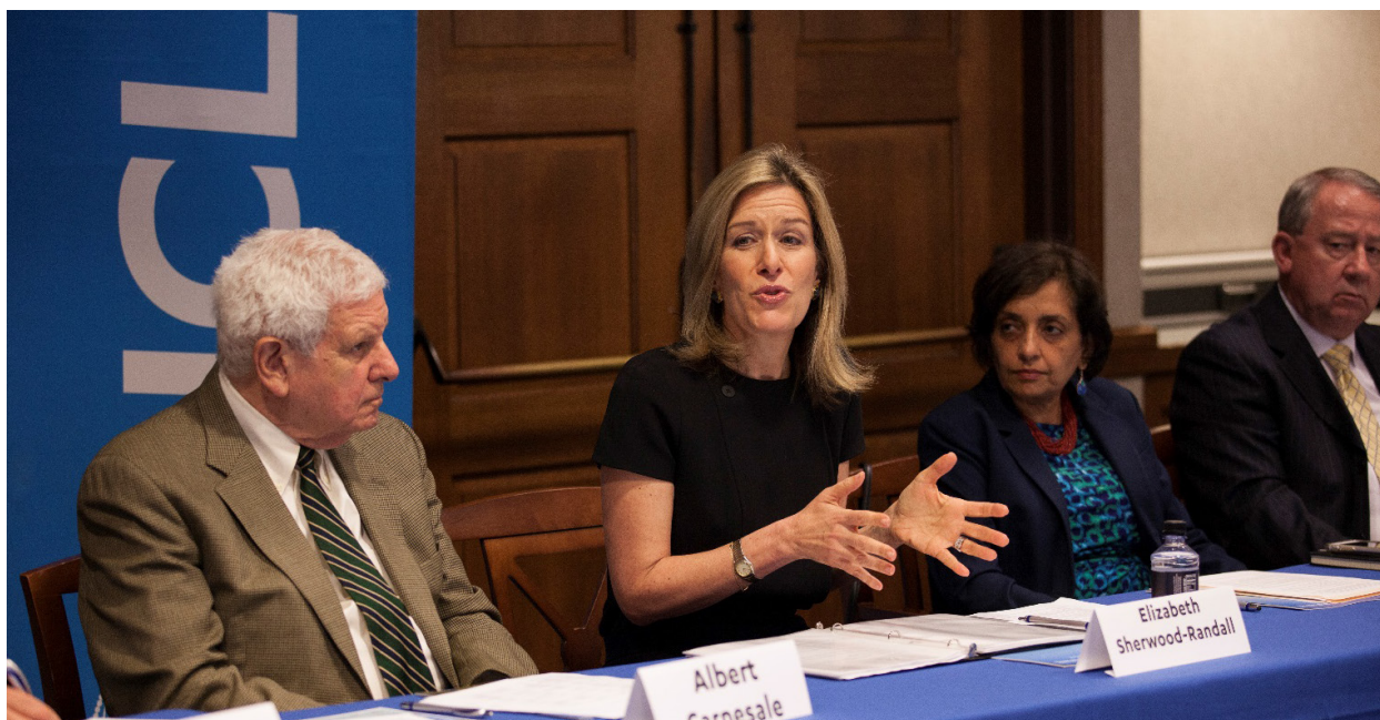
Elizabeth Sherwood-Randall, Ph.D., U.S. DOE Deputy Secretary, provides opening remarks on Mission Innovation and the role of regional partnerships during the Southern California Clean Energy Innovation Ecosystem Roundtable, which was hosted by UCLA on May 10, 2016.

revenues. This will, in turn, result in increased investment and accelerated implementation of clean energy. The interconnection rules and tariffs implemented by local utilities were developed and implemented based on increasingly obsolete rules.... These largely arcane paradigms need to be modified and streamlined to allow the ability to install new clean energy technologies without waiting months to years to follow through the filings and process required for interconnection by local utilities.” The group agreed that “California needs continued solar subsidies to level the playing field against subsidized fossil fuels and to facilitate utility-scale solar and wind development.” 62